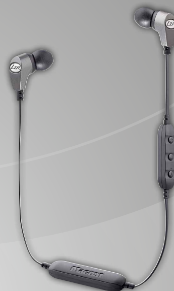
Magnat.LZR 548 BT